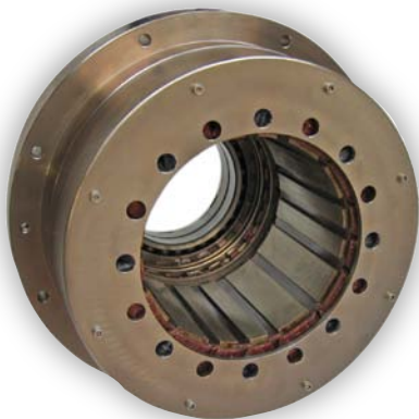
Radial bearing cartridge