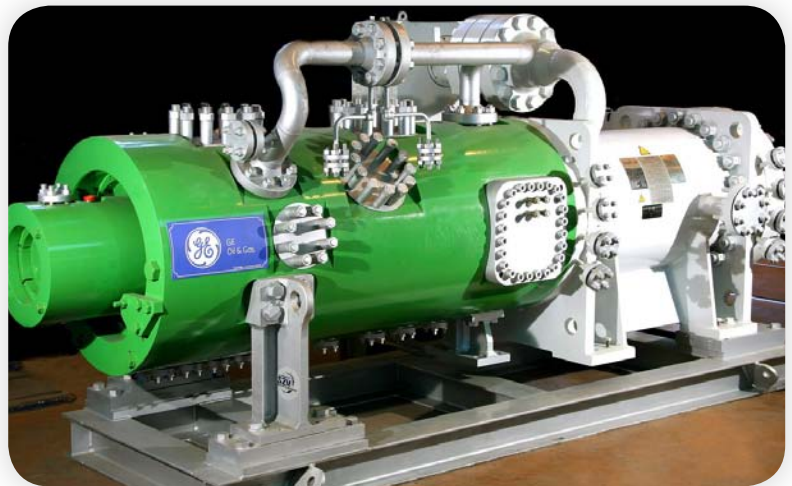
GE Integrated Compressor Line with Convertteam high speed motor (application : gas storage facility)