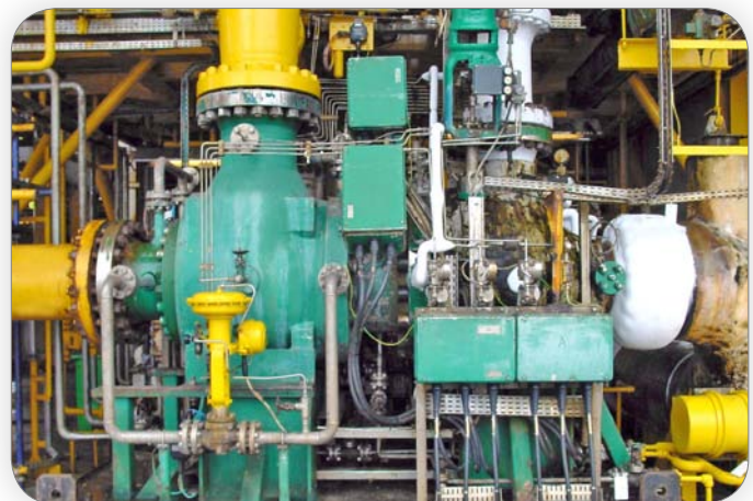
Example of a GE Rotoflow machine equipped with S2M bearings, operated since 1996 on the Total N'Kossa site (Africa)